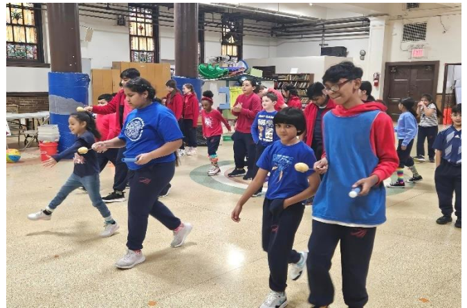
The Students of DMCA Shine!