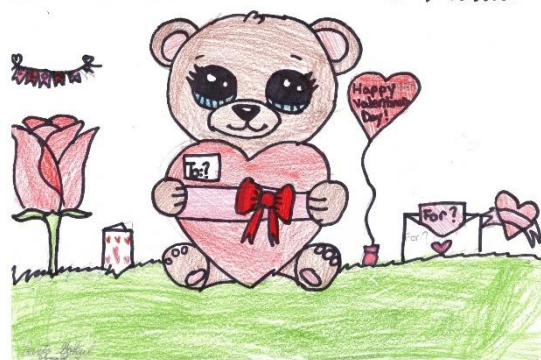
By Arti Gokul, Grade 5