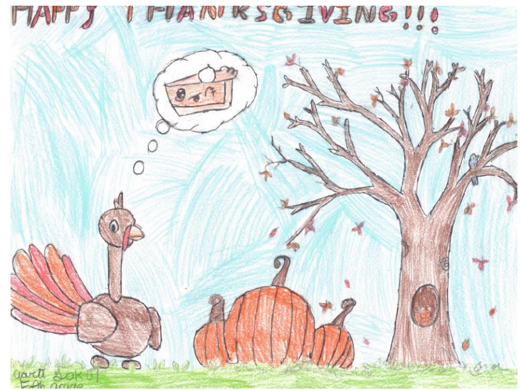
By Aarti Gokul, Grade 5